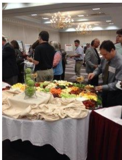
Good food and fellowship enjoyed by all.