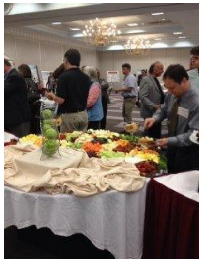
Good food and fellowship enjoyed by all.